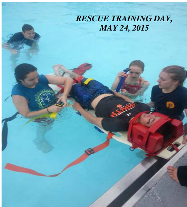
RESCUE TRAINING DAY, MAY 24, 2015